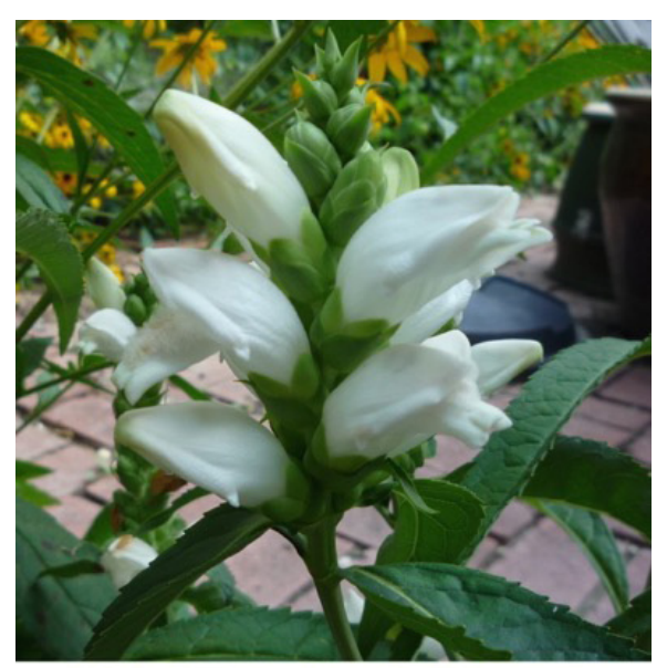
White Turtlehead (Chelone glabra)

Many plants' names are derived from descriptions of the plants: milkweeds have milky sap, fringetrees have frilly flowers, blueberries have blue berries, and jack-in-the-pulpit, well you know. Turtleheads have flowers that look like turtles' heads. To take this one step further, the genus (family) name Chelone is that of a nymph from Mount Khelydorea in Arkadia (southern Greece) who haughtily refused a summons to attend the wedding of Zeus and Hera. Big mis-