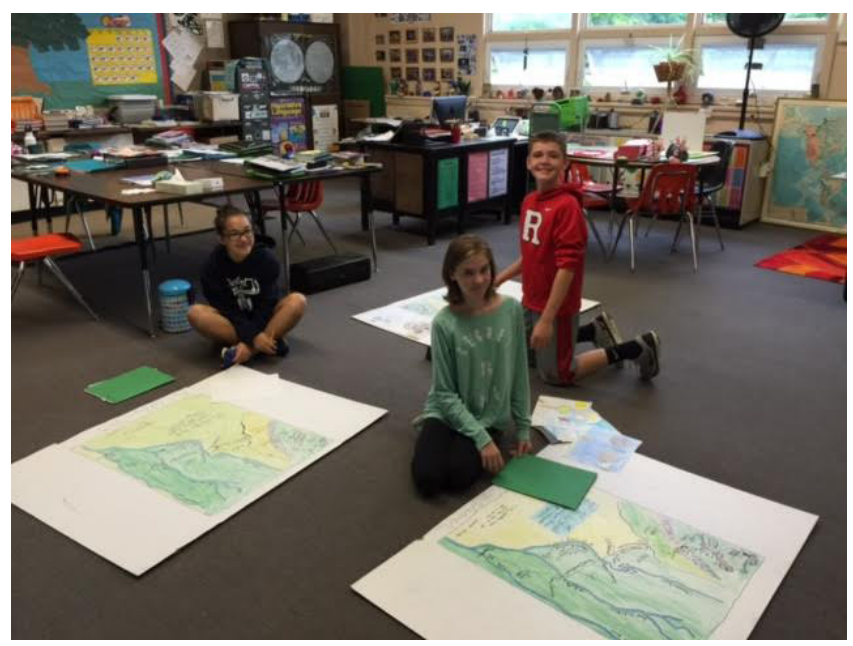
Even after graduation, our sixth graders were still hard at work!

Field Day and the annual "6th graders versus the faculty kickball game" enjoyed excellent weather. We were happy that former classmates were able to join the game.