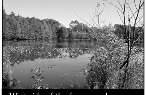
West side of the farm pond

Finally, a picture (I wish you could see this in color) of an October view from the west side of the farm pond off of Windsor-Perrineville Road looking east. I was standing in a spot where the first records of two sedges had been found a few days before and looking out over the pond. I was thinking that Roosevelt had not only preserved a farm, but a beautiful little pond edge ecosystem that very few people, if any,